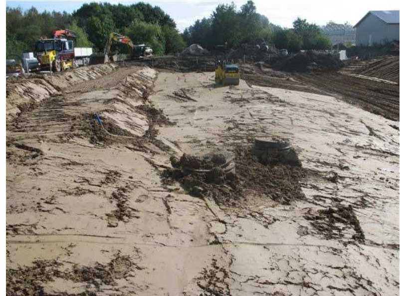
13.09.2007 Construction of clay membrane