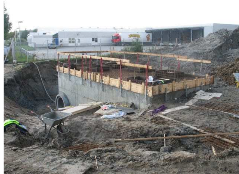
29.09.2007 – Construction of inflow structure