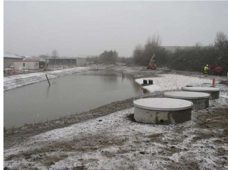
14.11.2007 – Structures for handling outlets from various sections