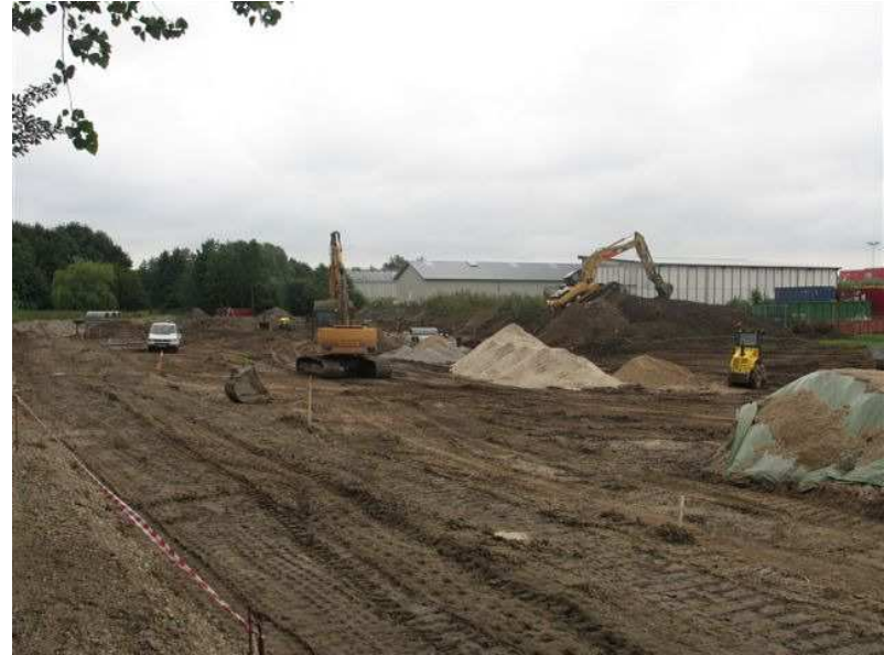
21.08.2007 – Earthwork in progress