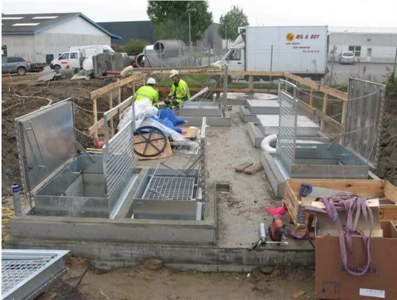
11.10.2007 – Inflow structure near completion