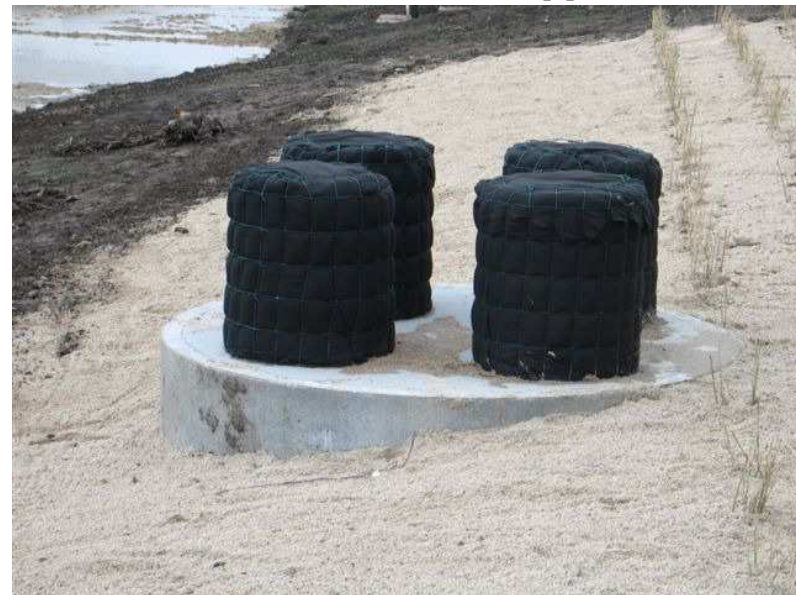
01.11.2007 Vertical sand filter