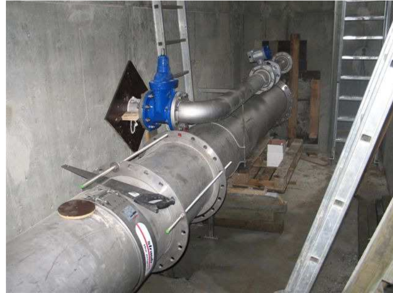
11.10.2007 – Inflow structure, stainless steel pipe installation