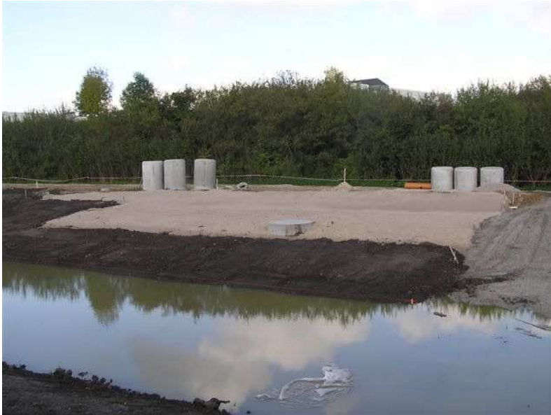
06.10.2007 – Sand filters constructed