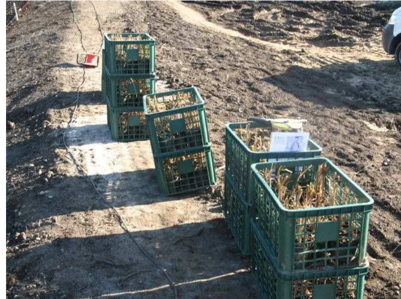
23.10.2007 – Bedding plants delivered