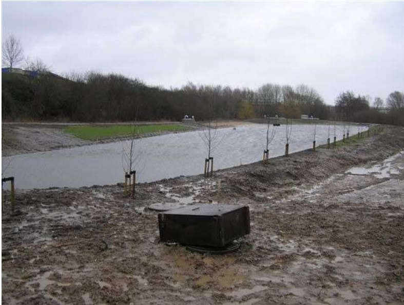
26.01.08 – Facility completed except minor finish improvements