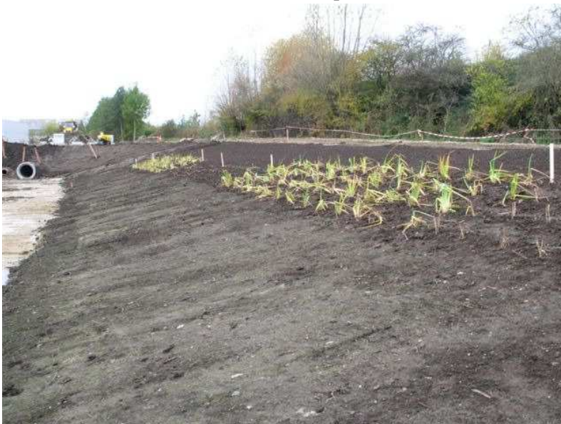
01.11.2007 – Planting of bedding plants