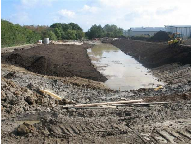
27.09.2007 – Moulding up the banks