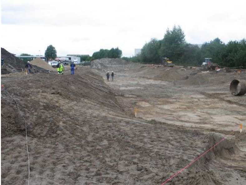
11.09.2007 – Excavated to Pond bottom level