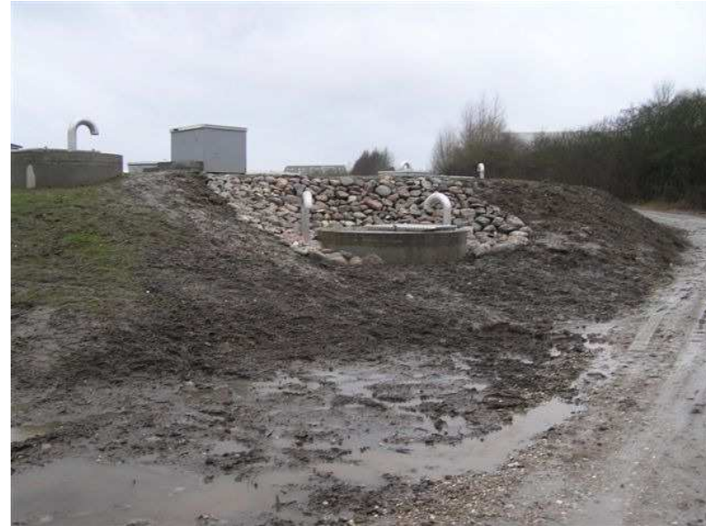
26.01.2008 Sampler structure