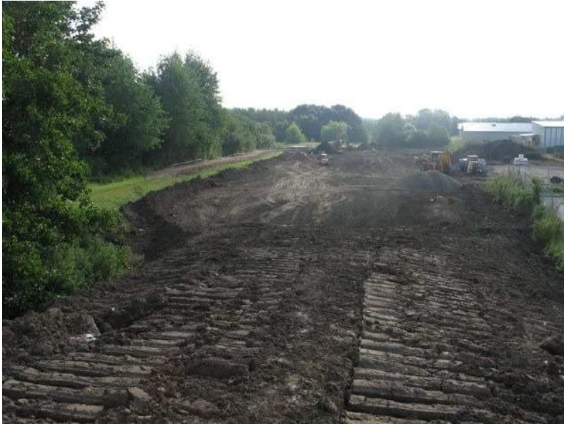
08.08.2007 – Mould removed from area